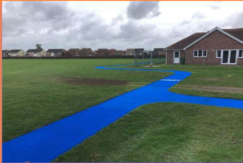
Attleborough Primary School, NR17 2NA