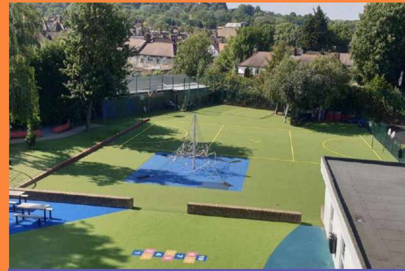
St. Mary's CE Primary School, N8 7QN