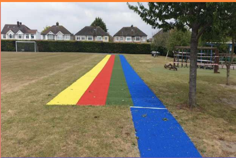
Wentworth Primary School, Dagenham