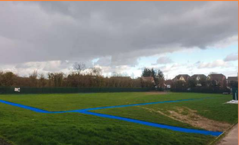
Our Lady of Ransom Catholic Primary School