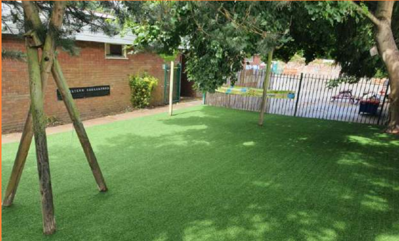
SS Peter & Paul Catholic Primary Academy