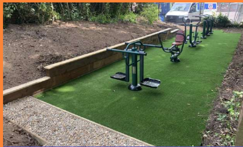
Bitterne CE Primary School, SO19 7BX