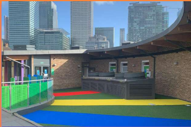
Our Lady of St Joseph (OLSJ) London E14