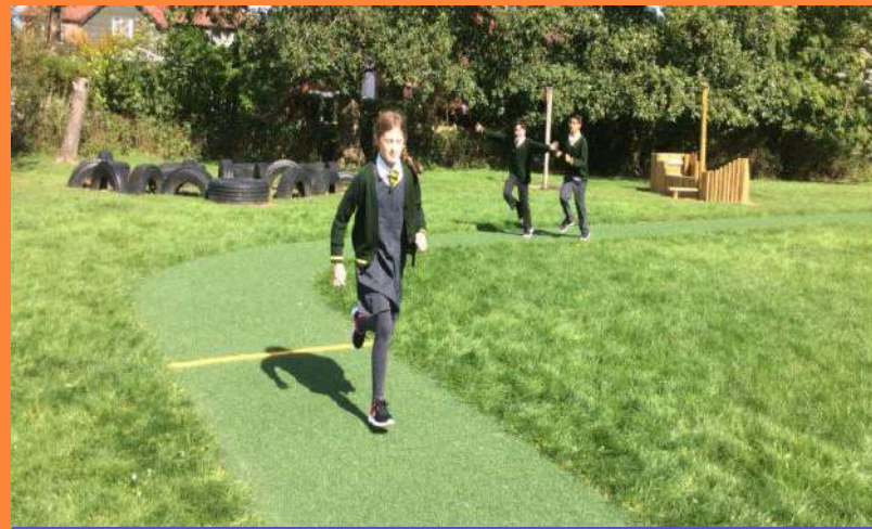
Elmridge Primary School, Altrincham