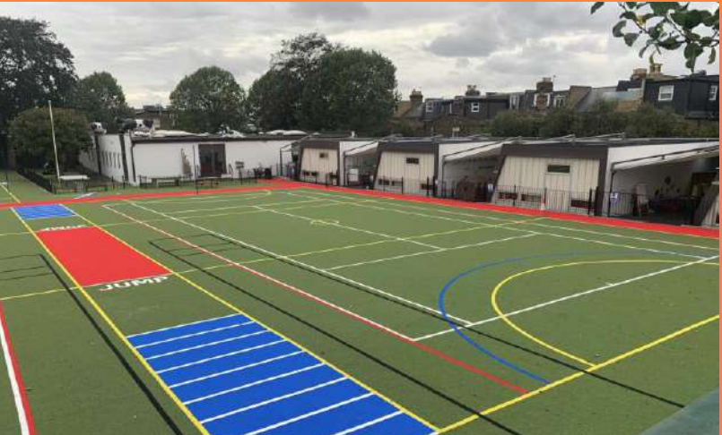
Thomas's Clapham Independent School