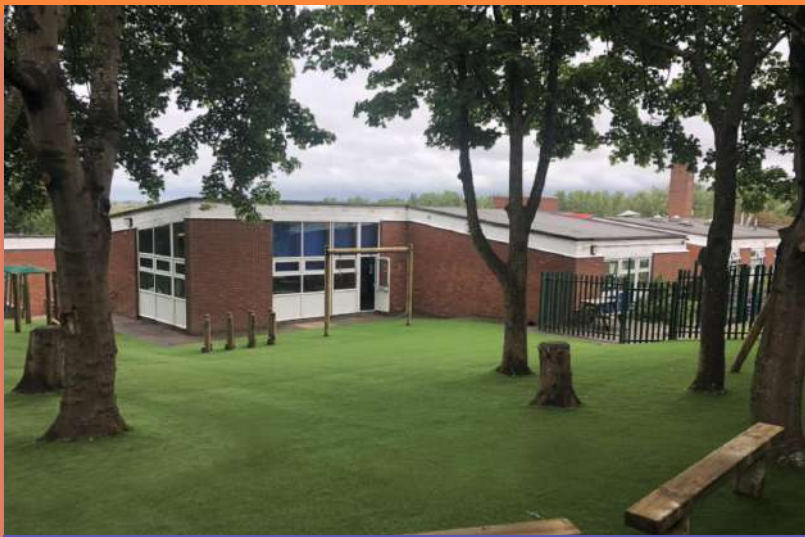
The Observatory School, CH43 7QT