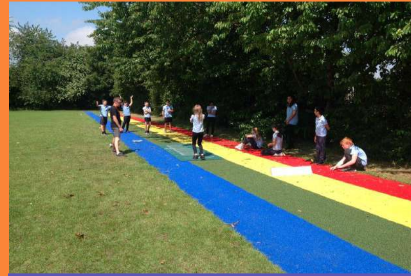
Church Hill C of E Junior School, LE4 8DE