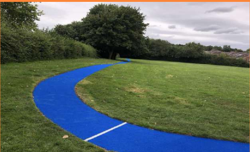
Hill View Primary School, Banbury